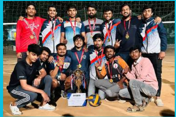
SPARDHA - 2023 Volleyball Men - Winners At, CMRIT