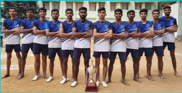
VTU Bengaluru Central Division Kho Kho Men - Winners At, Vemana IT