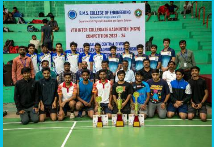
VTU INTER COLLEGIATE BADMINTON (M&W) TOURNAMENT BENGALURU CENTRAL DIVISION & STATE LEVEL CHAMPIONSHIP SELECTION TRIALS (2023-24)