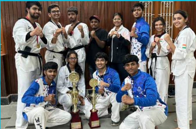
VTU State Level Tournament- 2023 Taekwondo Championship (M&W) At, SIT