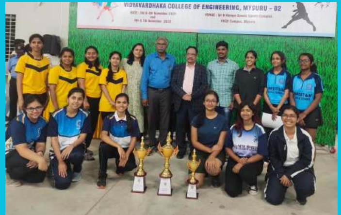
VTU State Level Tournament- 2023 Table Tennis (W) At, Mysuru